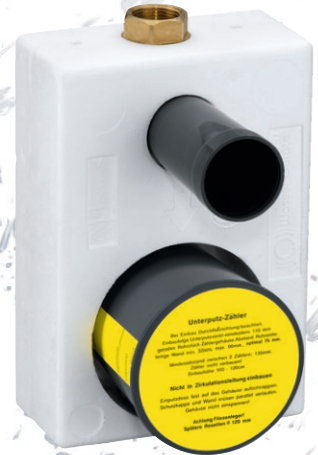
Installation rack single