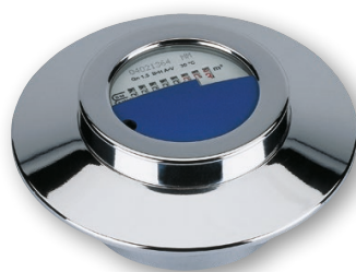
In-wall compact meter for modular radio system (ECO)