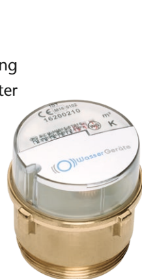
The intelligent measuring capsule system: Unimeter