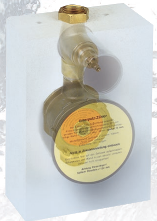
Installation thread the cost effective alternative