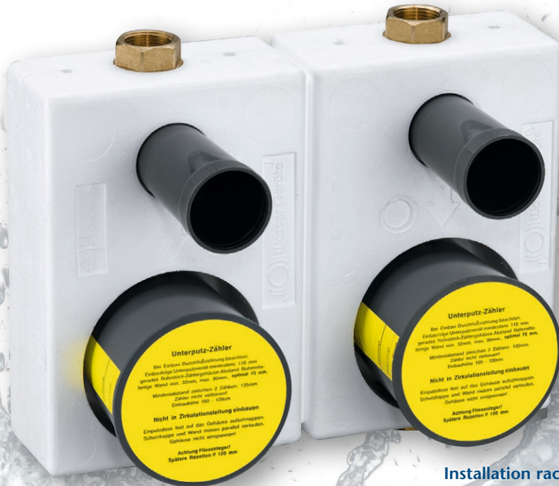
Installation rack double incl. accessories, mounting bracket