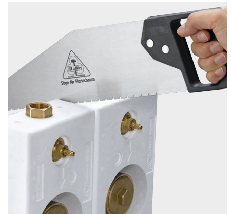
Separation of the installation rack (into a single rack) with a common handsaw