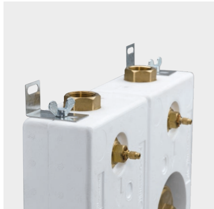
Example of mounting incl. mounting brackets